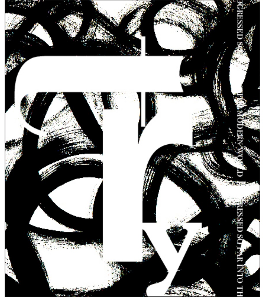
5 Composition: Line, Texture, Form