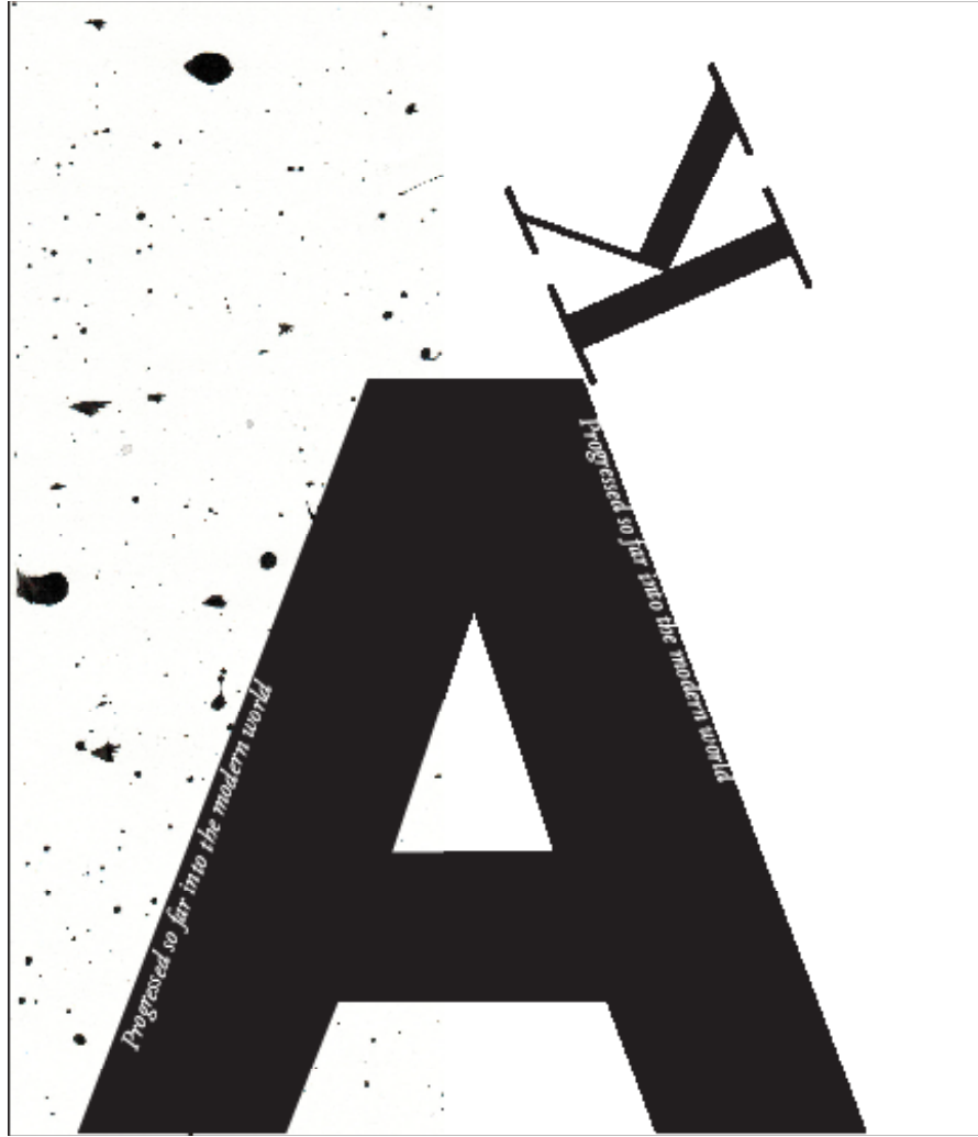
4 Composition: Line, Texture, Form