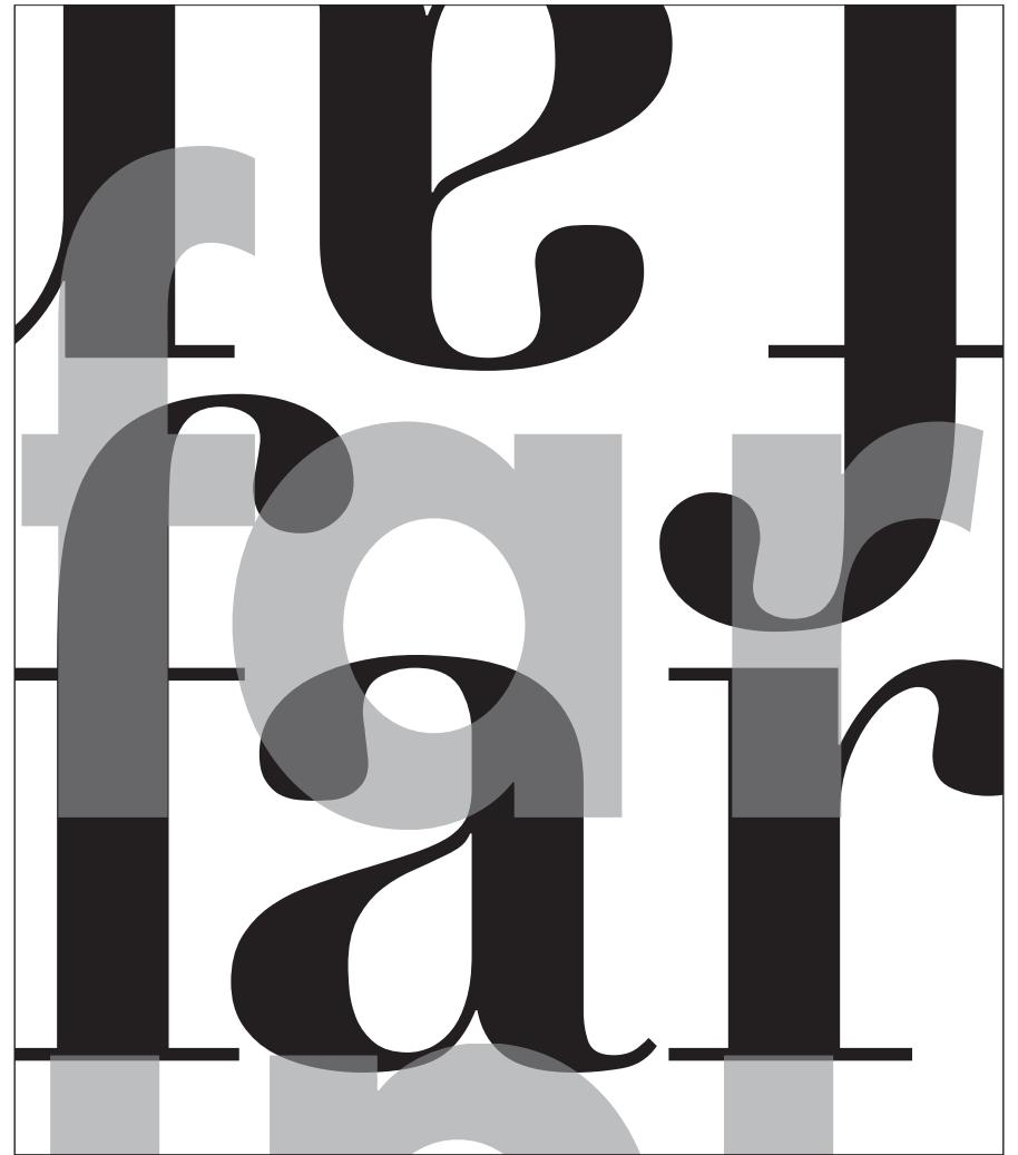
11 Contrast: Structure & Color